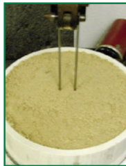
Staple Pull-Out Test

The world's toughest 100% biodegradable landscape stake