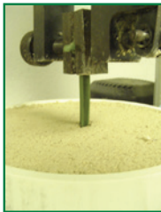
GreenStake Pull-Out Test